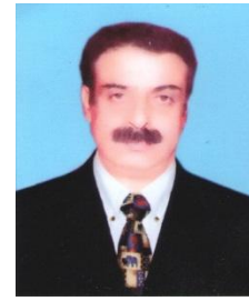
Director General Economics & Statistics